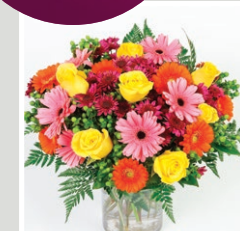
Designer's Choice by Lyndsay