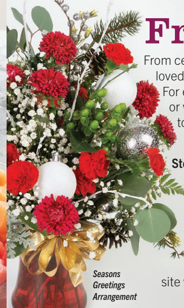
Seasons Greetings Arrangement

Shop simple floral bouquets and potted floral through our site with pickup and delivery available through instacart!