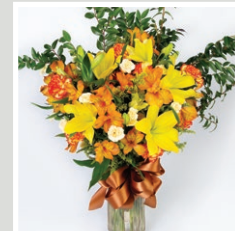
Crisp Fall Day